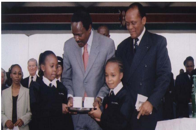
The Vice President and Minister for Home Affairs, His Excellency, Honourable Stephen Kalonzo Musyoka, EGH, MP, being presented with a gift by St. John Badgers during the Annual Parade and Inspection ceremony held on 22nd June 2008.